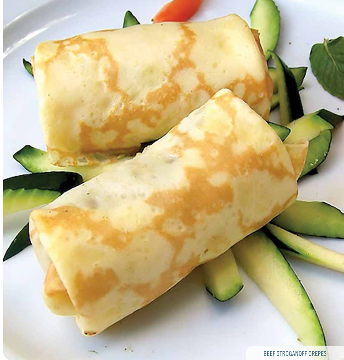
BEEF STROGANOFF CREPES

Bringing joy back to dining for individuals with physical and cognitive challenges.