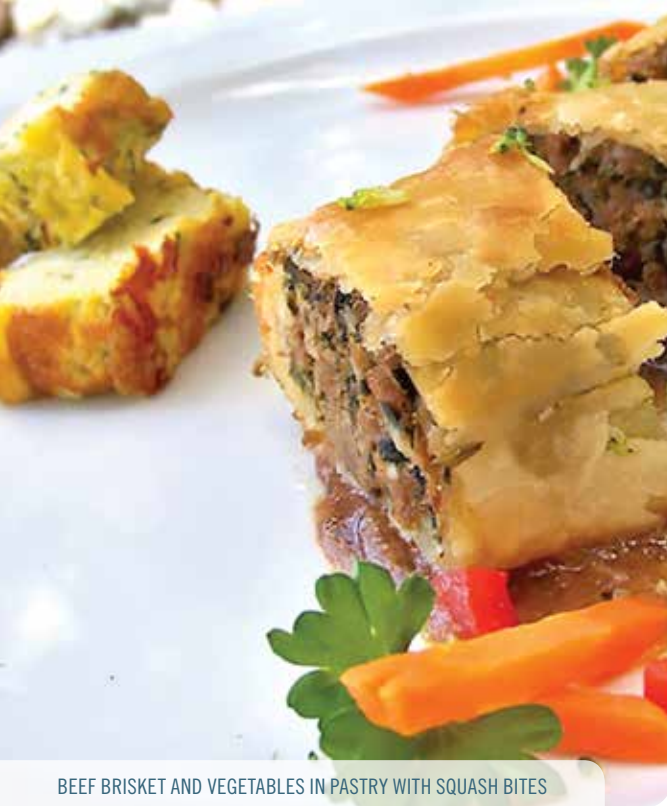
BEEF BRISKET AND VEGETABLES IN PASTRY WITH SQUASH BITES