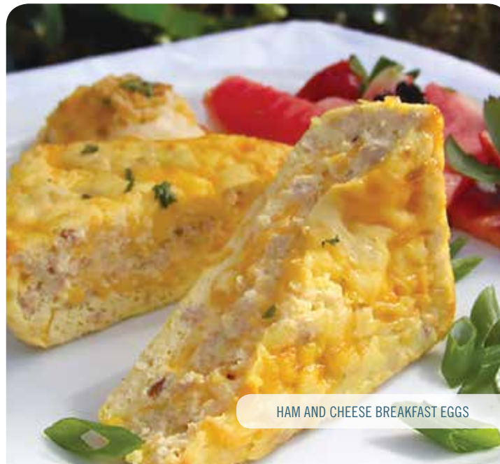
HAM AND CHEESE BREAKFAST EGGS