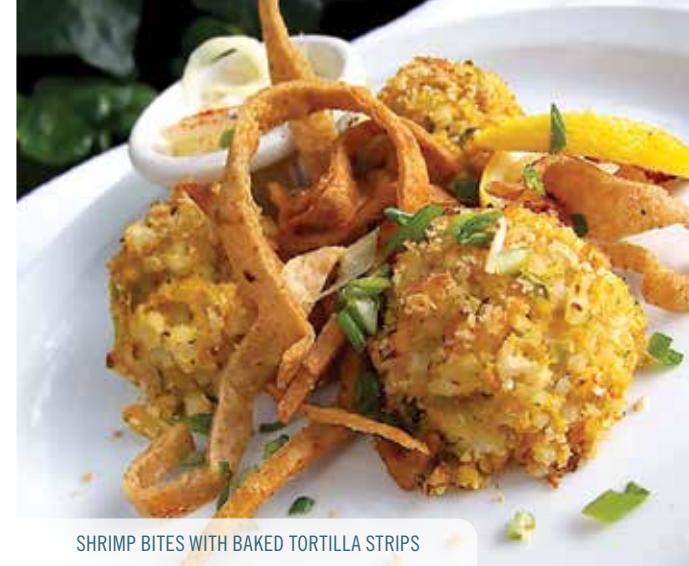
SHRIMP BITES WITH BAKED TORTILLA STRIPS